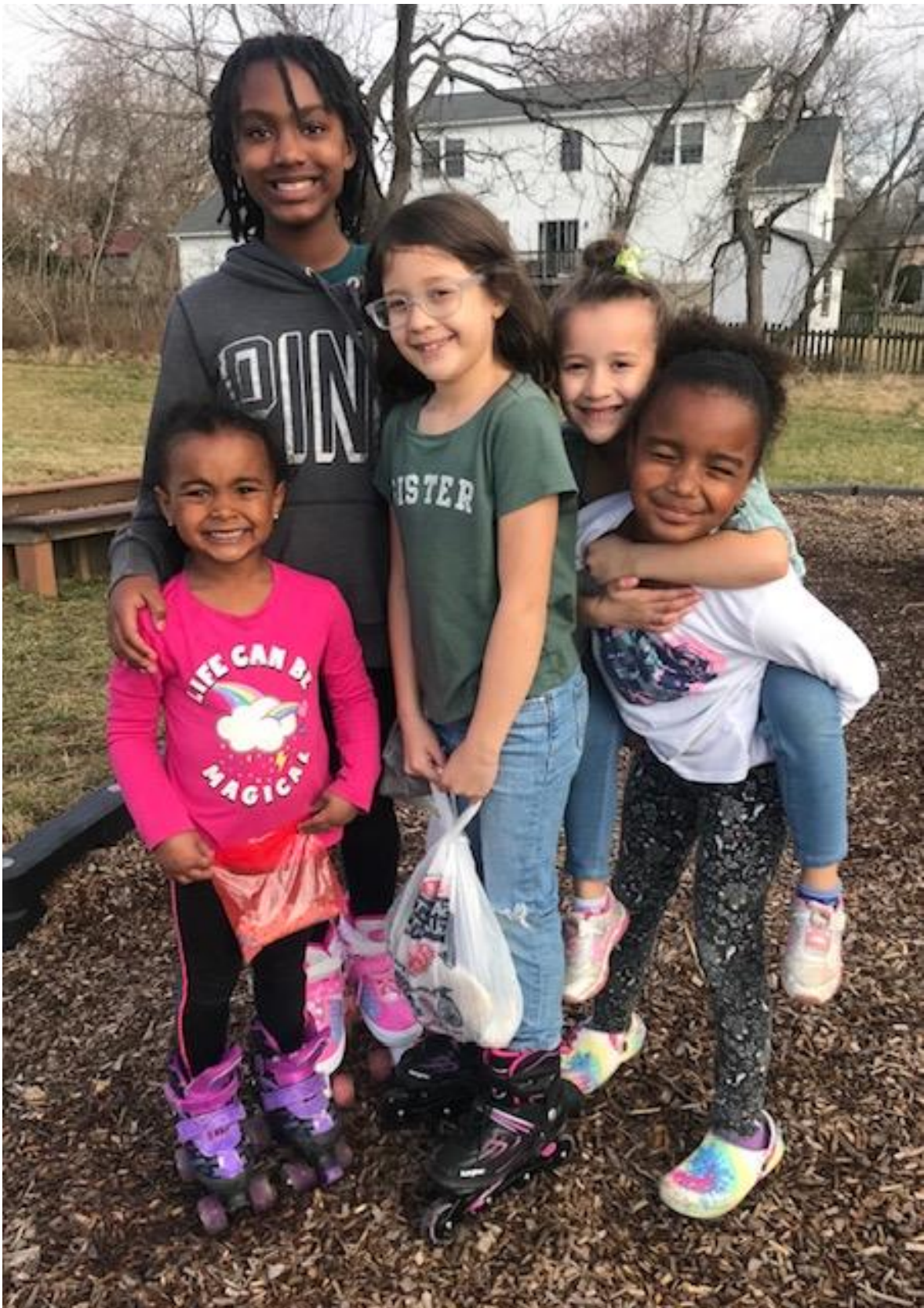
Springtime makes for time outdoors with best friends, roller skates, and smiles all around!