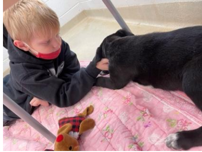
Looks like everyone made a friend!